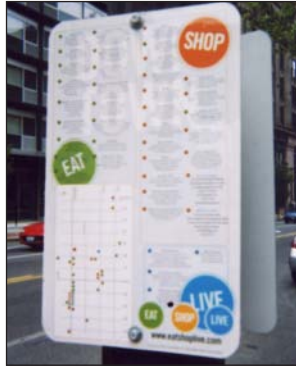
Store directory at key point encourages crossing wide street to shops area