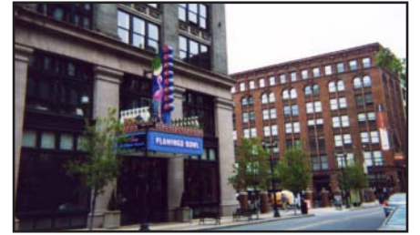
Flamingo Bowl sign is big, high and colorful