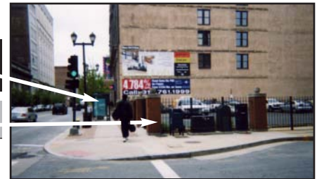
Brick pillars soften fence which hides parking lot