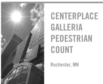
Retail Recruitment Brochures and Intercept Surveys