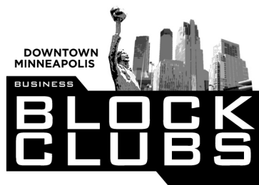
Business Area Security and Other Services